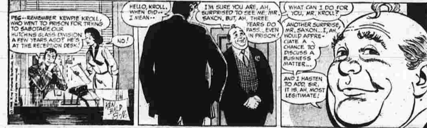
BY LANK LEONARD