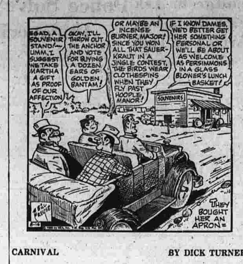
BY DICK TURNER