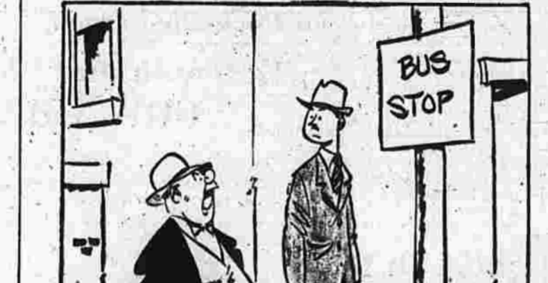
BY FRANK ONEAL