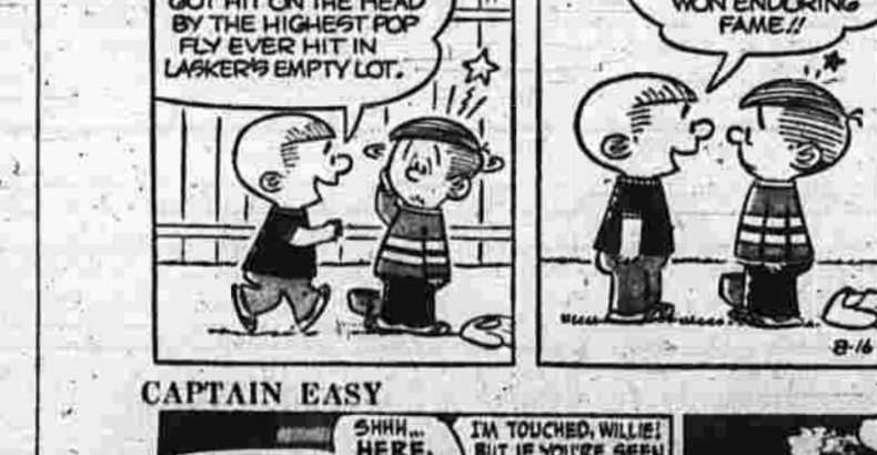
BY PETE HOFFMAN