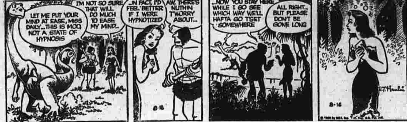
BY AL VERMEER